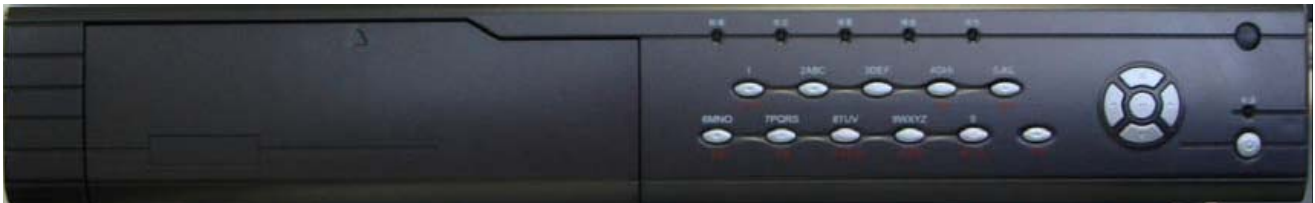
TT-DVR7008HE Front Panel