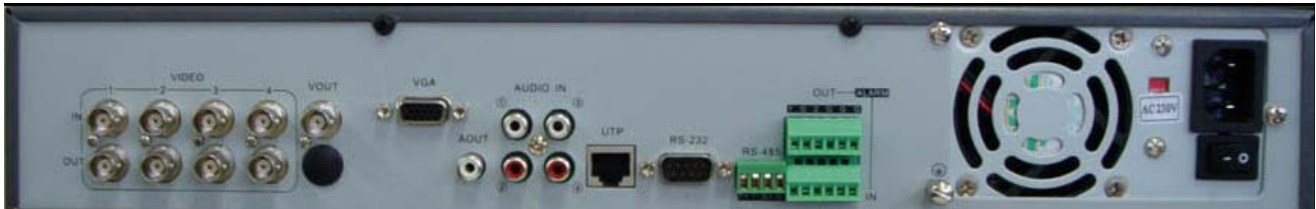
TT-DVR7004HE Rear Panel